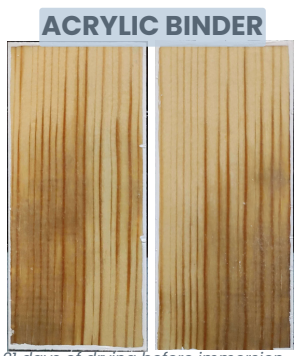
Pine wood – Brush application - 2 layers - 21 days of drying before immersion Pictures : after 4 days of immersion in distilled water

Nourishes wood while maintaining its natural appearance